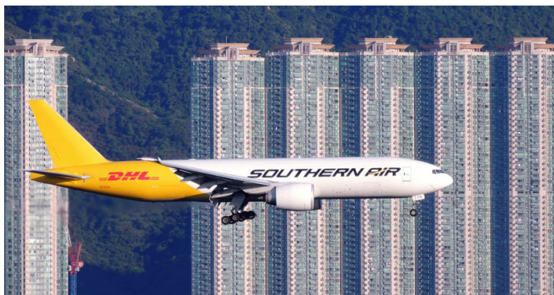
Figure 7. Landing in the middle of buildings in Hong Kong.

As we have seen, the absence of internalisation is a source of environmental inequalities between those who create damage to