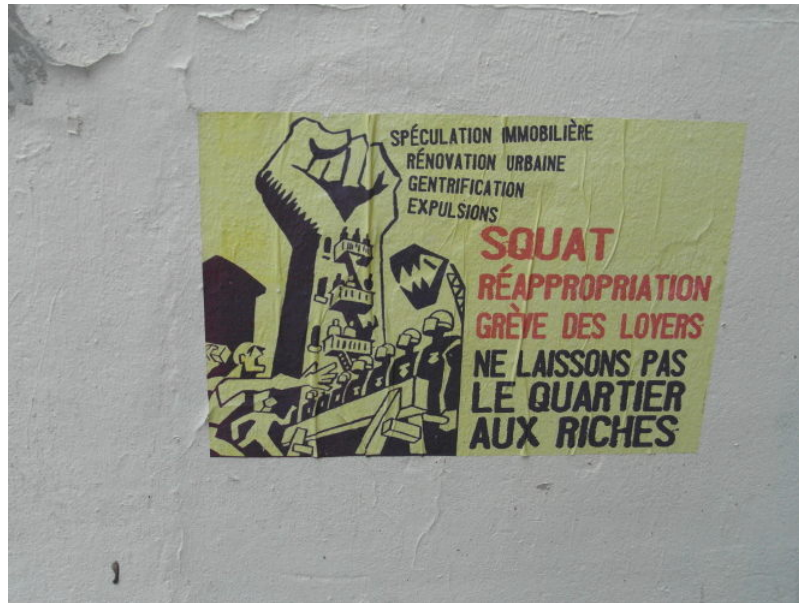
Figure 2. Poster denouncing the processes of planning and eviction of poor populations (Paris, 20th)

long history of "urban marginalization" and racialization of behaviour (bankers, urban planners, local communities, individuals' residential choices...) [6].