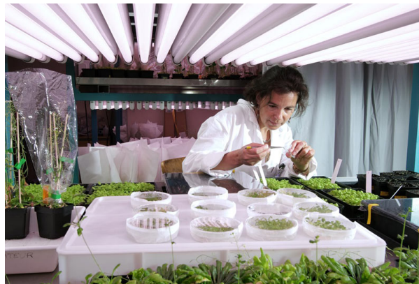
Figure 3. Experimentation on Arabidopsis thaliana seedlings.

A third level of adaptation falls between the two previous levels. Like the first level, it is individual and plays only on the regulation of gene expression, without intervention on their structure. But this third level involves a transient hereditary transmission of these regulations. This allows descendants, over a few generations, to benefit from the adaptive response of their parents. This is referred to as epigenetic memory or transgenerational effect (see Epigenetics, the genome and its environment ). This type of phenomenon has been known for a long time, but it has remained relatively exceptional. The first known cases mainly concerned paramecia, unicellular eukaryotes {ind-text} Unicellular or multicellular organisms whose cells have a nucleus and organelles (endoplasmic reticulum, Golgi apparatus, various plasters, mitochondria, etc.) delimited by membranes. Eukaryotes are, along with bacteria and archaea, one of the three groups of the living organism. {end-tooltip} . Since 2000, examples have multiplied and cover a wide range of characters. They have often been observed in response to environmental stresses, but also in the case of maternal behaviours in rats [2].