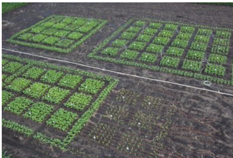
Figure 1. Field trial of the international RIPE project for improving photosynthesis productivity (RIPE, Illinois, USA).

American and German researchers have observed that some photosynthetic microorganisms have three pathways of P-glycolate metabolism, the glycolate pathway followed by CO 2 loss that is common to plants and bacteria, and two other pathways specific to bacteria that metabolize P-glycolate but do not emit CO 2 external to the leaf tissue. These last two pathways have not been transmitted to plants through evolution. It was then tempting to introduce them into the plants. This was done, not without difficulty, by transferring by genetic engineering these two specifically bacterial metabolic pathways into C 3 type plants, tobacco in particular. Processed tobacco plants showed 20-40% higher photosynthetic activity compared to unprocessed C 3 plants, which is a great technical achievement. Finally, the trial was also "transformed" in the field (Figure 1), which was not a foregone conclusion. Now these researchers are trying to confirm these results and replicate them on field crops and forest plants. [1]