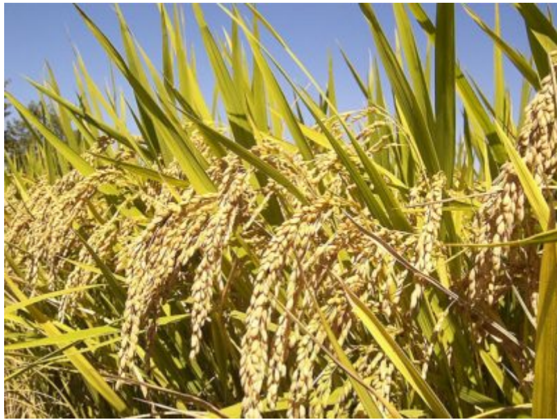
Figure 2. Rice plants.

Scientists are currently devoting many efforts to the transformation of rice, plant C3, into plant C4. Rice has many advantages for such processing, one of them is a very favourable leaf structure (Figure 2). Such attempts are most important as rice grows in hot and humid regions, an environment that is highly conducive to C4-type photosynthesis, which is more economical in terms of water and nitrogen than C3 photosynthesis. Many tests have been attempted but without much result so far because the C4 system compared to the C3 system involves many genes and systems for regulation and self-assembly of new and complex operating units. Following these failures, scientists are looking for specific regulatory genes for these metabolisms with a view to revealing candidate genes in rice, a sort of 'C3 - C4 switches' that could be introduced by transgenesis in this plant.