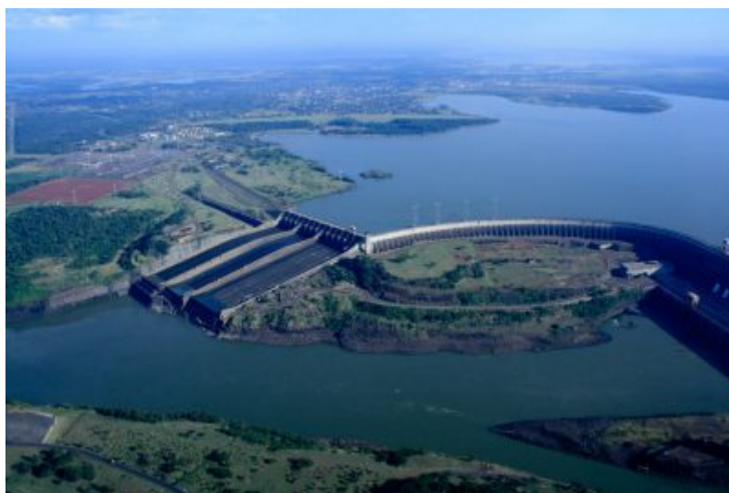
Figure 3. Itaipu hydroelectric plant on Rio Paraná, on the border between Brazil and Paraguay.

The Cerrado plays a major role in Brazil in water supply and water quality control, and is sometimes referred to as the "water box of Brazil", the "cradle of Brazil's waters" or the "arc of springs". The vegetation of the Cerrado avoids too much water interception by foliage (as is often the case in forests), allows efficient water retention and infiltration into the soil and filtration of the water that feeds aquifers and rivers.