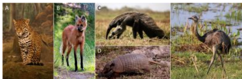
Figure 2. Some examples of the Cerrado fauna. A, Jaguar ( Panthera onca ); B, Maned wolf ( Chrysocyon brachyurus ); C, Giant anteater ( Myrmecophaga tridactyla ); D, Yellow armadillo ( Euphractus sexcinctus ); E, American rhea ( Rhea americana ).