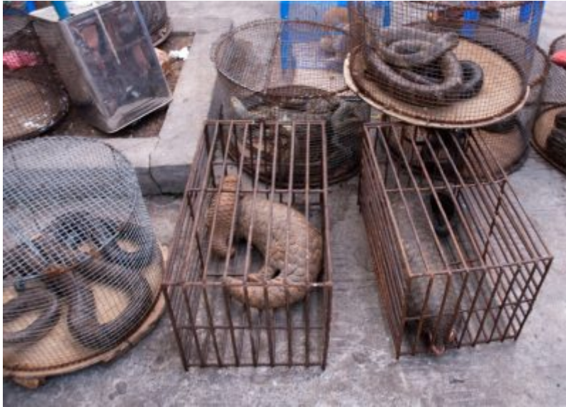
Figure 4. Illegal market for endangered wildlife including pangolins in Mong La, Shan, Myanmar.

In the end, the passage of the virus through one or more intermediate hosts remains the scenario favoured by researchers. At the beginning of the epidemic, pangolin was claimed to have played the role of intermediate host, but this hypothesis tends to be increasingly rejected. Nevertheless, Malaysian pangolins seized by Chinese customs in 2019 did provide a coronavirus with an amino acid sequence of the receptor binding domain (RBD) to the human ACE2 receptor that closely resembles that of the RBD of SARS-CoV-2 [8]. This raises the question of the link between pangolins and bats. Pangolins are very solitary animals and are severely weakened by coronaviruses. It may be necessary to accept the simple hypothesis that these intensely trafficked animals may have been contaminated by other wild animals or by traffickers while being kept (Figure 4), transported or sold on Chinese markets [9].