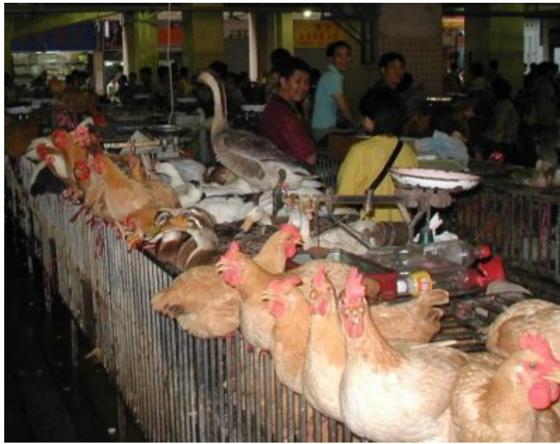
Figure 2. Asian market.

At the beginning of the COVID-19 epidemic, it was a market that attracted the attention of the health authorities, the market from Huanan to Wuhan, which, supposedly offering only seafood, was in fact clandestinely selling a multitude of live wild animals . The market was quickly closed down and barred from access, preventing any further investigation. However, the few samples that could be taken showed the presence of SARS-CoV-2 in the immediate market environment (contact surfaces, soil and waste water) and not in the animals intended for sale. Therefore, it had to be admitted that the market (Figure 2) was not the cause of the epidemic, it would simply have acted as an amplifier of viral transmissions by concentrating humans, some of whom were already contaminated [1] .