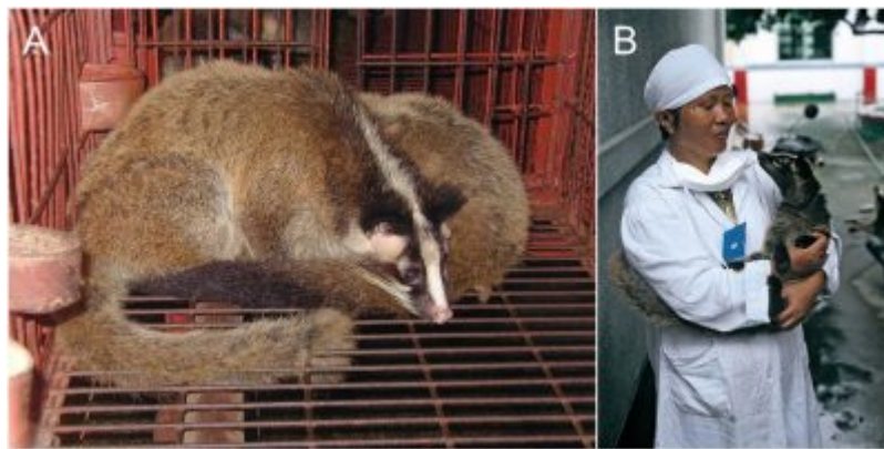
Figure 5. Masked palm civet raised on a farm: A, in a cage or B, in the arms of the breeder.

Among other potential intermediate hosts, classical farm animals such as pigs, chickens and ducks were considered but no virus circulation was observed in them. However, pets such as cats, ferrets and dogs have shown varying degrees of susceptibility to SARS-CoV-2. It is therefore not convincing to consider that they could have played the role of intermediary, especially since the owner of the animal seems to have been the source of its contamination in each case [10].