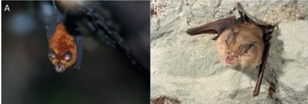
Figure 1. Horseshoe bats. A, Indonesian horseshoe bat ( Rhinolophus sp.) in Tangkoko Nature Reserve (Sulawesi).; B, Greater horseshoe bat ( Rhinolophus ferrumequinum ).

China occupies a central place for the spread of coronaviruses. Indeed, it is a vast country whose varied climates give rise to a great diversity of bats and viruses (Table). In addition, bats are in close contact with a large human population, which potentially promotes the transmission of viruses to humans and farm animals.