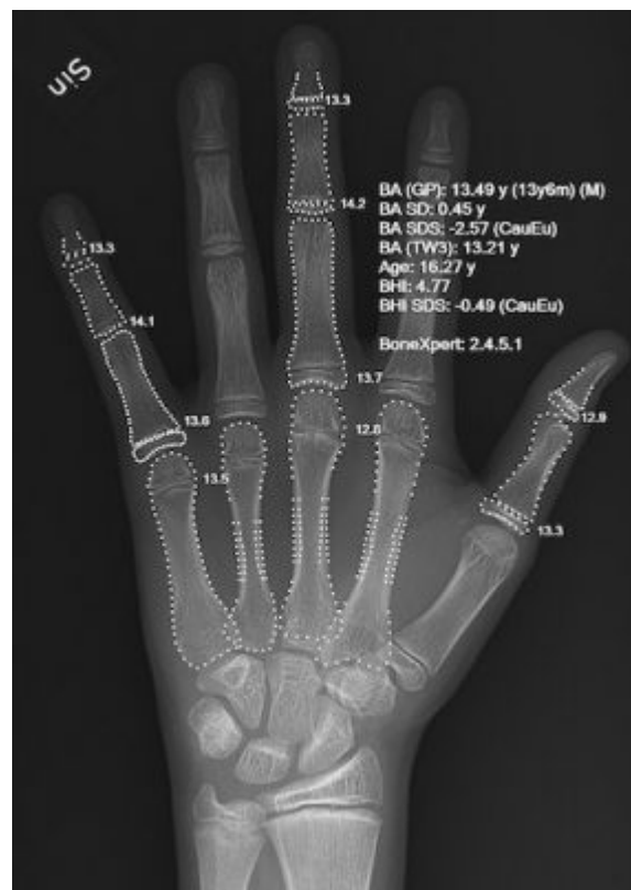
Figure 3. 16.27 year old male hand X-ray with automatic bone age calculation taken due to delayed puberty. The bone age determined by the tests is lower: two different algorithms give values of 13.21 and 13.49.

Authorities say that because of the advantages of being considered minors, some unaccompanied refugees claim to be younger than they actually are. But the anatomical tests currently used to assess age [7] have an error range of up to 3 to 4 years (Figure 3). Studies are also underway to assess how the various ethnic backgrounds of European refugees might influence the epigenetic clock. One can imagine other future applications, such as monitoring child labor and trafficking, or even identifying youth fighting in armed conflicts.