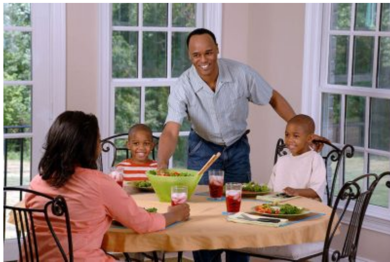
Figure 2. A diet rich in, fruits and vegetables tends to decrease epigenetic age.

That lack of sleep, stress or alcohol would also have detrimental effects.