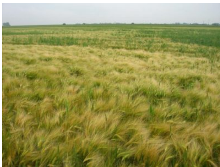
Figure 1. Wheat field. The biomass of cultivated plants is only a tiny fraction (2%) of the total plant biomass, worldwide.

Estimates of the impact of agriculture on the world's animal and plant biomass are difficult to quantify over long periods of time and on all continents, and vary greatly depending on the group considered.