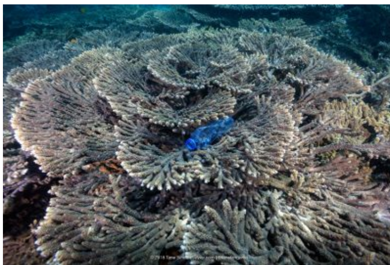
Figure 1. Acropora sp. holding a plastic bottle. [Photo © Tane Sinclair Taylor, 2018].

Sometimes called the 7 th continent (see Plastic pollution at sea: the seventh continent ), plastic pollution of the oceans is becoming a major scourge. About 270,000 tonnes of plastic float on the surface of our oceans [1] and many more drift between two waters. Their impact on marine life is well identified: turtles, birds or marine mammals often die after ingesting plastic residues from can bags or packing rings that we dump into the environment. Every year, plastics kill 1.5 million animals. However, the impact of plastics on reef-building corals had been ignored until now, perhaps because of their alleged distance from plastic sources. However, analysis of plastic debris in the oceans has shown that it can carry many bacteria, including some pathogens that cause coral disease [2].