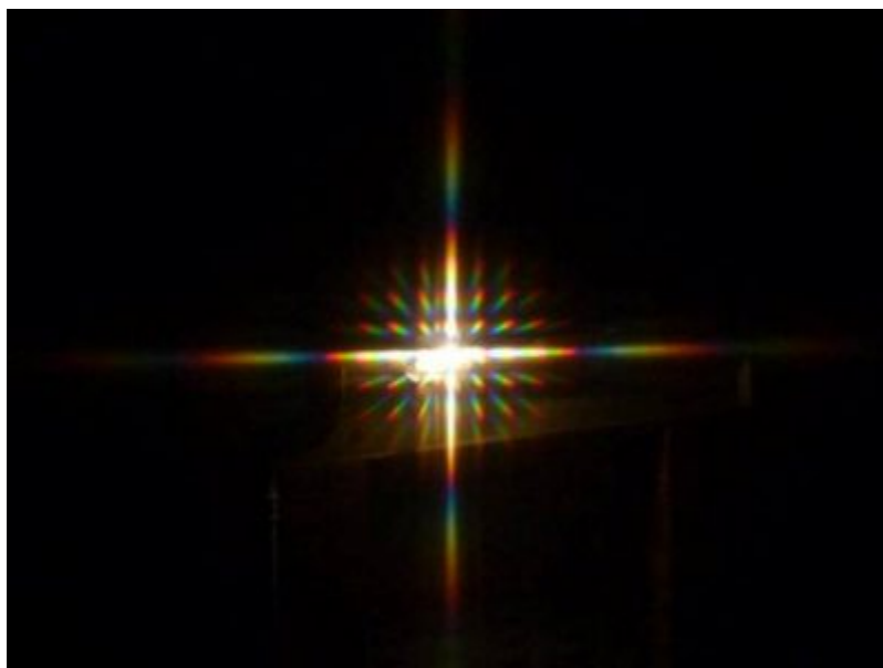
Figure 3. Diffraction of polychromatic light through a circular orifice. The central spot is white due to the superposition of all wavelengths. Peripheral spots represent the entire spectrum of visible colours, with the shift in various wavelengths increasing as we move away from the centre.

These three types of diffusion correspond to different modes of interaction of light with the diffusing object. For objects that are large in relation to wavelength , it is possible to reason in terms of light rays , which corresponds to geometric optics. At the interface between two media, part of the light is reflected, and the other part passes through the interface with a modified propagation direction: this is called refraction . This process is observed in a prism like the one in the vignette of the focus Deviation of light by a prism (link). The different wavelengths of white light have different refractive angles, which leads to colour separation. Water drops or ice crystals can act as prisms, which leads to rainbows ( Spectacular Rainbows ) or other atmospheric halos phenomena ( Atmospheric Halos ). In clouds, reflections and refractions are multiple, which blurs the separation of colors, and restores the white color of sunlight.