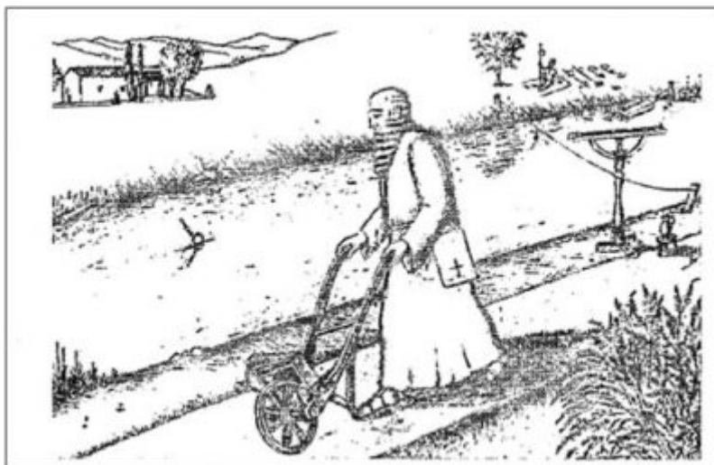
Figure 1. Surface velocity measurement by Leonardo da Vinci.

The first river flow measurements were made by Greek mathematicians and mechanics Ctesibios and then Heron of Alexandria (3rd century BC and 1st century AD respectively). This was a work of no consequence, because in the West, the principles and practice of hydrometry were then forgotten until the Renaissance.