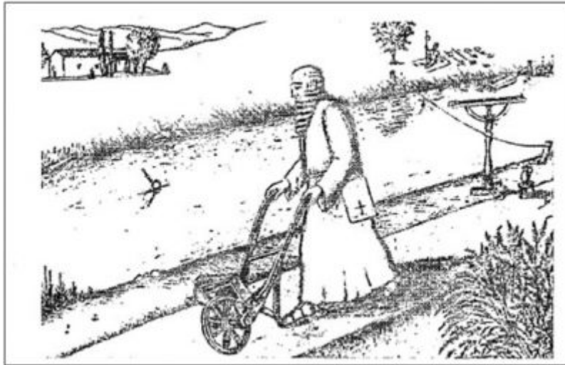
Figure 1. Surface velocity measurement by Leonardo da Vinci.

The first river flow measurements were made by Greek mathematicians and mechanics Ctesibios and then Heron of Alexandria (3rd century BC and 1st century AD respectively). This was a work of no consequence, because in the West, the principles and practice of hydrometry were then forgotten until the Renaissance.