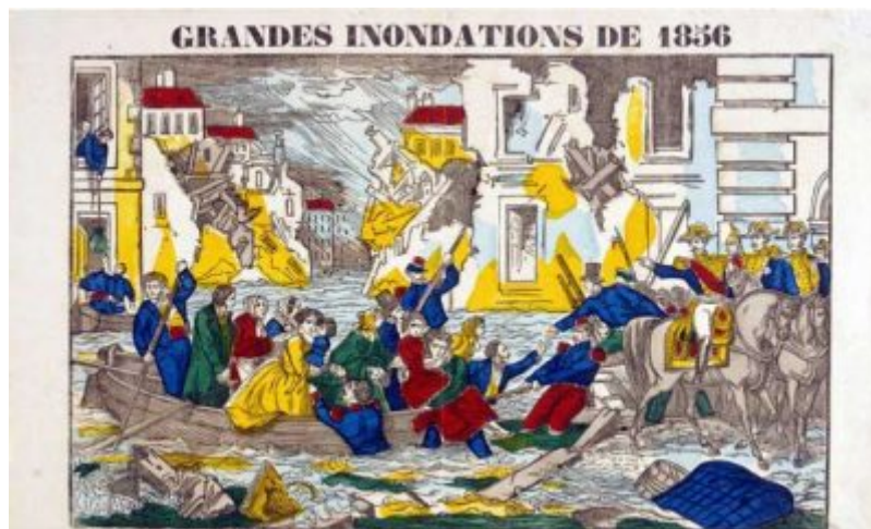
Figure 4. Flooding of the Loire in Orléans. Spring 1856 was accompanied by catastrophic floods, particularly on the Rhône and Loire rivers. It is under the administration of Napoleon III (represented on the right in this image of Epinal) that the systematic observation of watercourses in France was really structured. "Before seeking the remedy to a problem, it is necessary to study the cause well" he wrote to the Minister of Public Works on July 19, 1856 (letter called "de Plombières"); he thus illustrates the Saint-Simonian principle of carrying out studies in order to determine the actions to be undertaken.

During this 19th century, as the socio-economic system became more complex and modern, it also became more vulnerable. The great floods of the 1840s and 1870s triggered major discussions in Western Europe. In 1854, Eugène Belgrand set up a monitoring system with the ambition of predicting the floods of the Seine in Paris three days in advance.