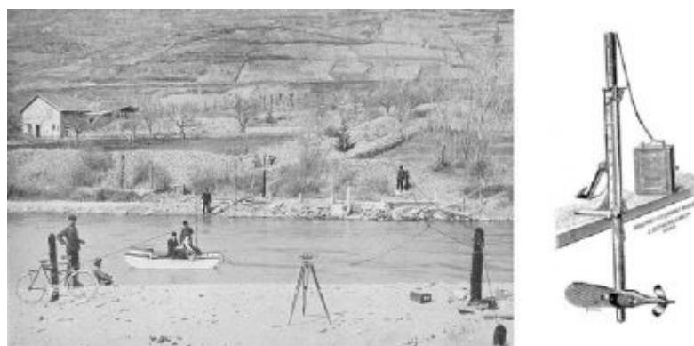
Figure 5. Gauging by exploring the speed field on the Durance at Embrun (Hautes Alpes) in 1910; on the right, Woltman principle reel of the "Richard" brand used from the boat.

controlled in the early 1950s. The first tracers used called for very significant quantities to be spilled: for a river flow of about 2.5 m 3 /s, two gauges on the Guil on 17 February and 11 March 1944 called for the injection of 1480 and 2190 kg of denatured salt respectively. For this reason, other tracers were sought, stable, highly soluble and not present in water in its natural state. Sodium dichromate was introduced in France in the early 1950s and was massively replaced in 1990 by fluorescent rhodamine tracers.