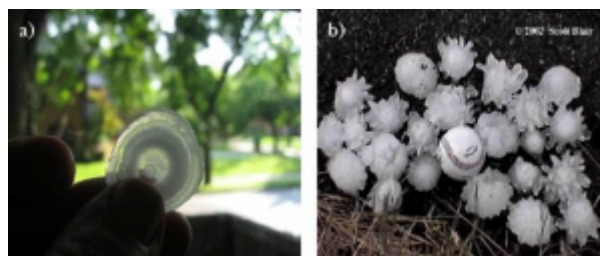
Figure 1. Photos of hail: (a) cutting of a hail showing its concentric layer structure [Licensed under the GFDL]; (b) hail consisting of aggregates of ice crystals

Hail is a type of precipitation made up of pieces of ice, the size of which, sometimes large (several millimetres or even centimetres), can cause damage. How is it formed? During the ascent of air in the cumulonimbus, water vapour can condense as droplets under the 0°C isotherm, and as ice crystals above. When the lift is very strong, droplets are transported above the 0°C isotherm, where they can remain liquid as "supercooled water". They agglomerate around ice crystals and freeze, forming a layer of translucent ice around them. Hail grows by accumulating several of these layers of ice forming hail. They can also grow by collecting small ice crystals, forming a layer of white ice. When the deposition of layers of translucent ice and icing alternate, hail with a concentric layer structure is obtained (Figure a). This occurs when the hail rises and falls several times in a row, or when it encounters an alternation of such conditions during its ascent. Hail can also grow by agglomeration of other ice crystals or other hailstones, forming aggregates (Figures b and c). They fall when their fall speed exceeds the upward velocity of ascending air, so only the fastest ascents can allow large hail to grow.