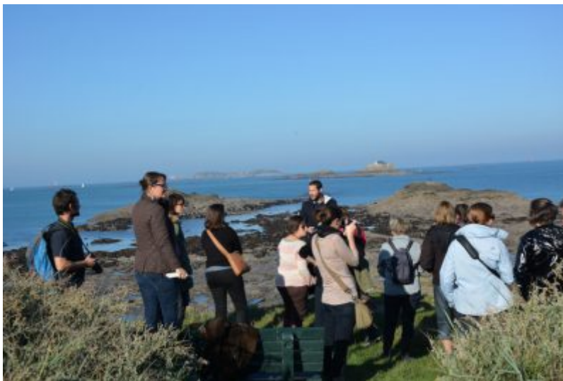
Figure 2. Participatory science monitoring (Biolit Programme) on the Dinard Coast (Ille-et-Vilaine)

The “ Sauvages de ma rue ” program, for example, has provided information on the evolution of flora since 1883 through a comparison of data collected by observers since 2011 and data collected by botanist Joseph Vallot in Paris. The results show that the disappearance of horses in favour of cars, rising temperatures, soil pollution and the arrival of exotic species are the factors that have most influenced the observed changes (publication in progress).