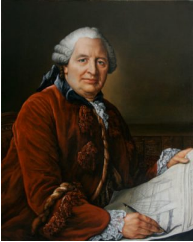
Henri-Louis Duhamel du Monceau (1700-1782), French naturalist. President of the Académie des Sciences where he popularizes climate issues.