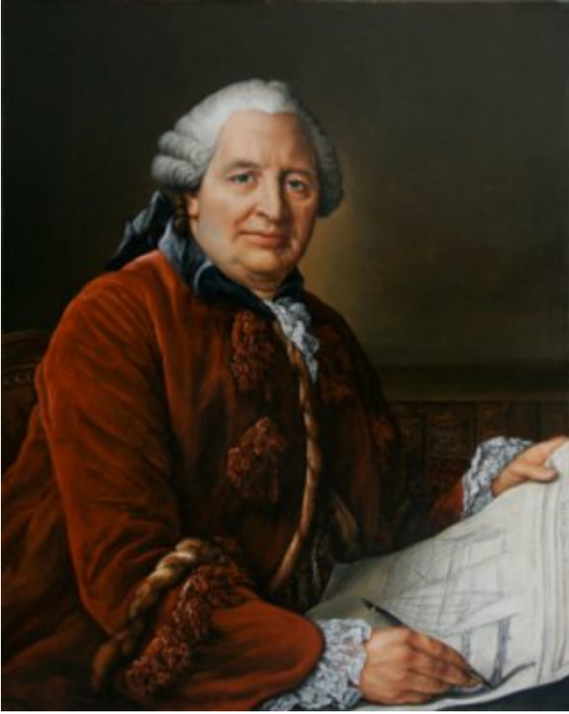
Henri-Louis Duhamel du Monceau (1700-1782), French naturalist. President of the Académie des Sciences where he popularizes climate issues.