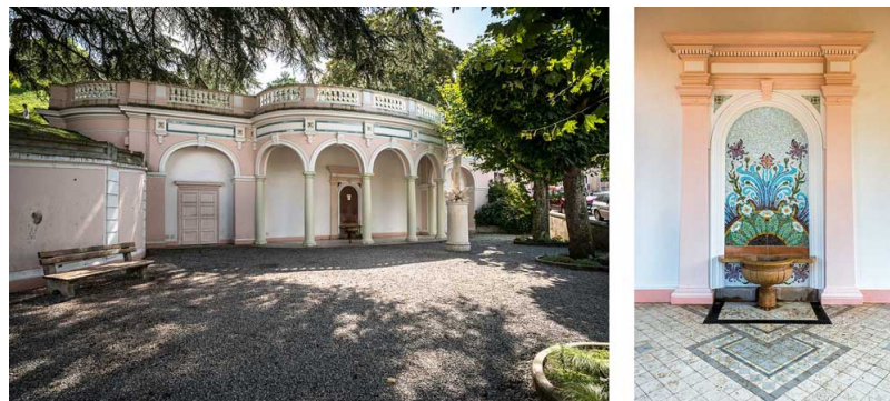
Figure 1. The Cachat bar in Evian-les-Bains continuously delivers Evian natural mineral water to the public.

In France, interest in thermal waters continued in the Middle Ages. All the thermal springs were even transformed into State property in 1549 with the letters patent signed by Henry II [1]. In 1605, Henry IV introduced the first state controls on the thermal and medicinal waters of the kingdom by creating the Superintendence of Mineral Waters. This State property being little respected by many landowners who privately exploit the water gushing out of their lands, Louis XV, while confirming this right in 1772, nevertheless recognizes that of the owners of the land on which springs gush. This problem was definitively resolved in 1781 by a decision of the Conseil d'Etat, which distinguished between sources belonging to the State and those present on the properties of individuals that they could exploit after authorization by the Royal Society of Medicine and subject to compliance with the regulations in force.