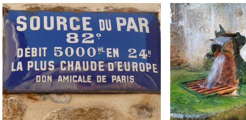
Figure 5. La source thermale du Par, at Chaudes-Aigues (Cantal), 82°C.

cool down gradually during this period; on the surface, it does not therefore have a significantly higher temperature than that of other sources, on the surface, in the area. It should be remembered that the temperature increases, on average, by 3°C per 100 m when you sink into the ground.