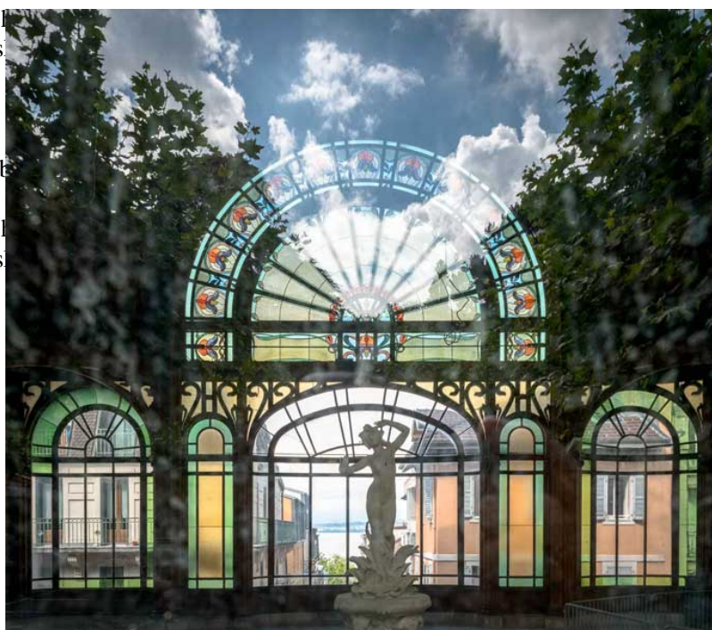
Figure 3. Spa in Evian-les-Bains

By regulation, EMN can be used packaged (in bottles), distributed in public refreshments (figure 1) or used for therapeutic purposes in a spa (figure 3).