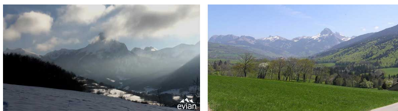
Figure 6. Overview of the impluvium of the EMN evian.

In order to preserve the long-term stability and purity of natural mineral water, bottlers have put in place " protection policies " for the impluviums (or catchment areas) of their sources. The catchment area is the territory on which the part of precipitated rainwater (and/or snowmelt) that infiltrates the subsoil feeds the mineral aquifer and thus contributes to the renewal of the resource. In other words, a precipitated drop on the impluvium territory may join the mineral aquifer; a precipitated drop outside this territory may eventually recharge other groundwater, but in no case may the mineral aquifer in question.