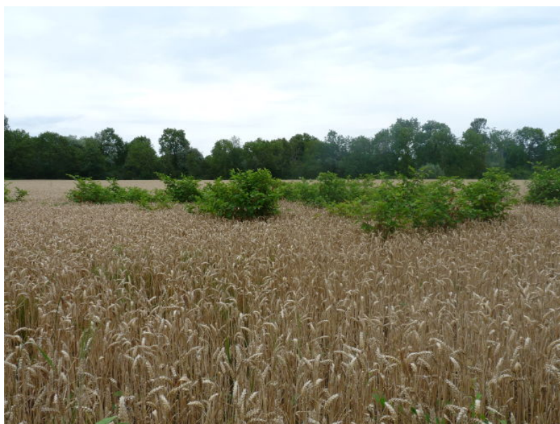
Figure 2. Reynoutria japonica in a wheat plot.

These practices create an environment in which a limited number of species can survive. Selection pressures are therefore both strong and frequent, but are also variable in space and time due to the crop rotation that takes place there.