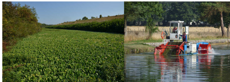
Figure 1. On the left, water lettuce ( Pistia stratiotes L.) invading the Rhône counter-channel near Avignon. On the right, collection of aquatic plants in the Burgundy Canal.

Of the 6,000 vascular plant species recorded today in France, more than 20% are considered non-indigenous, but only slightly more than a hundred have proliferating behaviour, at least locally. Many texts attempt to regulate or organize the fight against these species. The latest European Regulation 1143/2014 [1] on the management of the introduction and spread of invasive species sets out rules to prevent, minimise and mitigate the adverse effects on biodiversity of the introduction and spread of these species within the European Union.