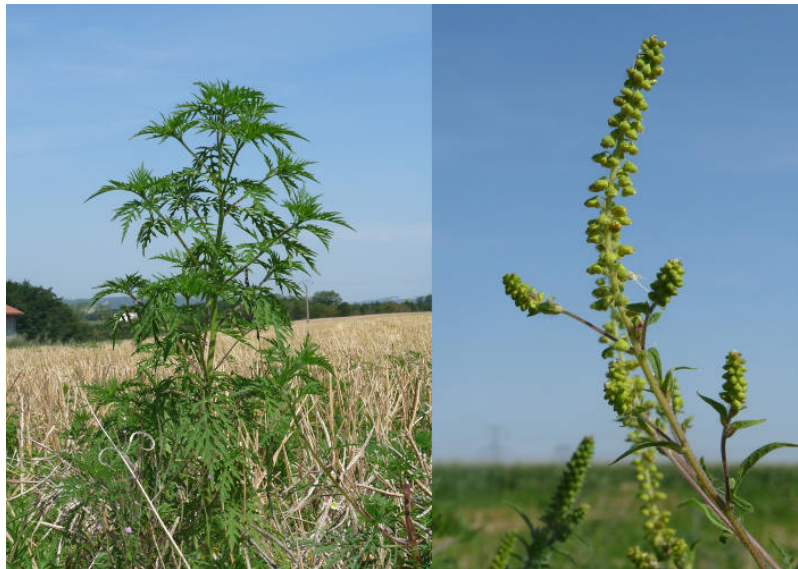
Figure 6. Ambrosia artemisiifolia in cereal stubble (left) and male flower inflorescence (right) from which allergenic pollen grains are released.

Known for its highly allergenic pollen [11], common ragweed is also a highly competitive weed species for crops such as sunflower and soybean. Unlike other invasive alien species, its arrival and development in France are relatively well documented, partly because of its particular morphology, which inevitably attracts the eye of the botanist, and partly because of its concomitant introduction period to the constitution of large herbarium collections in France, where it is possible to find a wealth of information [12]. In the 1860s, the cultivation of red clover ( Trifolium pratense L.) was mentioned many times as the import vector for France but also for the other European countries concerned (Germany, Netherlands, Great Britain).