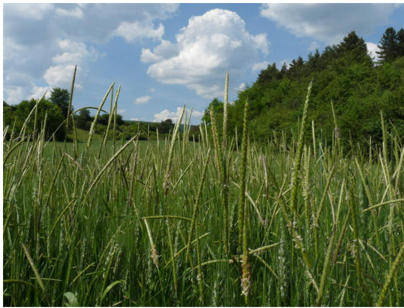
Figure 4. Alopecurus myosuroides is one of the most common weeds nowadays in cultivated plots because of its ability to adapt to farmers' practices but also because it has become resistant to some herbicides.

The black-grass ( Alopecurus myosuroides Huds.; Figure 4), an annual grass now present in more than a third of winter wheat plots in France (more than 2 million hectares), has been known since at least the 18 th century as a potential weed plant. From the 1960s onwards, this plant became one of the major weeds in our cropping systems in Europe due to its ability to adapt to short winter crop rotations. But, as with other weed species, its current success is also due to its genetic ability to resist different herbicide families to the point of making its management by chemistry alone uncertain.