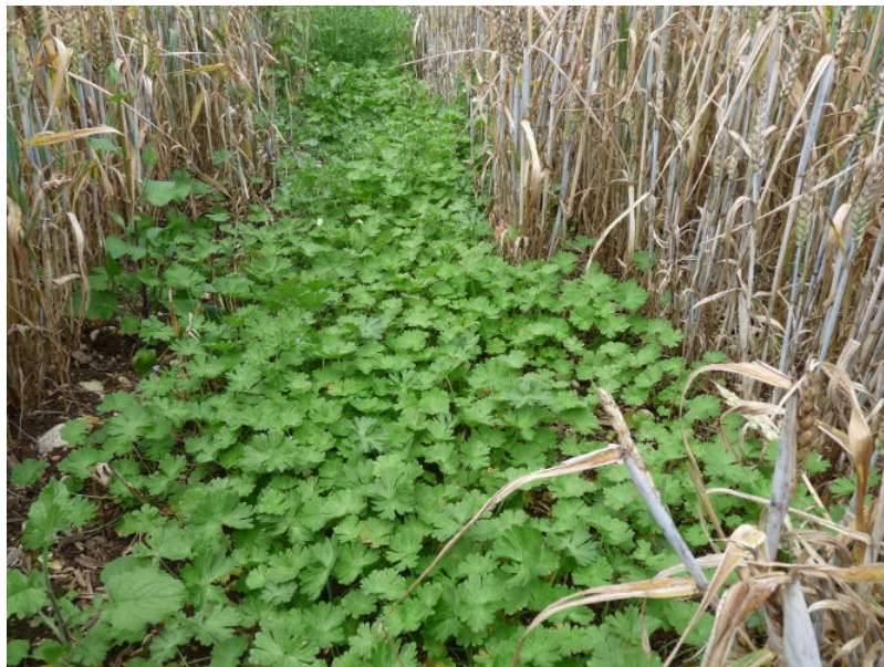
Figure 5. Strong development of geraniums ( Geranium dissectum ) in a wheat plot related to the ability of this plant to tolerate a number of chemical molecules.

The black-grass ( Alopecurus myosuroides Huds.; Figure 4), an annual grass now present in more than a third of winter wheat plots in France (more than 2 million hectares), has been known since at least the 18 th century as a potential weed plant. From the 1960s onwards, this plant became one of the major weeds in our cropping systems in Europe due to its ability to adapt to short winter crop rotations. But, as with other weed species, its current success is also due to its genetic ability to resist different herbicide families to the point of making its management by chemistry alone uncertain.