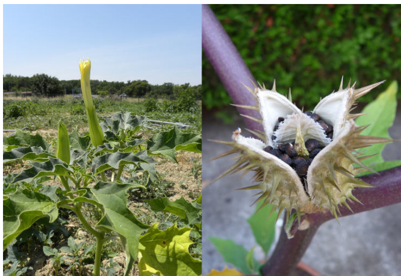
Figure 7. Datura stramonium ; flowers (left) and fruit (right).

Known for its highly allergenic pollen [11], common ragweed is also a highly competitive weed species for crops such as sunflower and soybean. Unlike other invasive alien species, its arrival and development in France are relatively well documented, partly because of its particular morphology, which inevitably attracts the eye of the botanist, and partly because of its concomitant introduction period to the constitution of large herbarium collections in France, where it is possible to find a wealth of information [12]. In the 1860s, the cultivation of red clover ( Trifolium pratense L.) was mentioned many times as the import vector for France but also for the other European countries concerned (Germany, Netherlands, Great Britain).