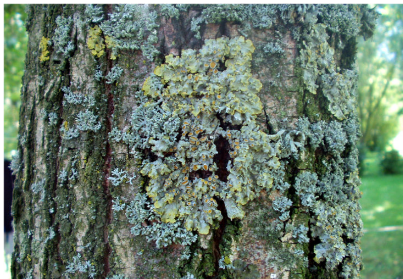
Figure 1. Examples of epiphytic lichens used for overall air quality biomonitoring. Noteworthy in this photo are Xanhorhnia parietina (yellow lichen), Physcia adscendens and Physcia tenella (blue lichens).

composition of lichen populations observed on trunks with an increase in pollution), as did Nylander previously mentioned. They have developed different methods for assessing the effects of air pollutants directly in the field, through the observation of lichen species. These methods were based in particular on the observation of the presence and abundance of species more or less sensitive to pollutants. The air pollution situation has gradually evolved and become more complex (decrease in SO 2 , increase in concentrations of nitrogen, ozone, organic compounds, etc.).