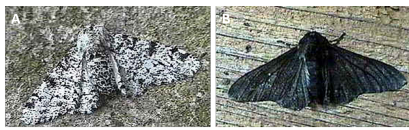
Figure 1. Industrial melanism in the peppered moth Biston betularia . This moth spends the day motionless on birch trunks, invisible to predatory birds (A, white typical morph). The black form, carbonaria (B), became the most abundant morph in polluted areas after the industrial revolution in England during the 19 th century.

Different individuals of the same species may encounter very different environmental conditions. For example, a plant growing in the plain does not face the same climatic constraints as a plant growing in the mountains. Similarly, an animal living in urban, agricultural or forest areas will not have access to the same resources and will not be exposed to the same pollutants... In addition to these abiotic Physical and chemical factors of an ecosystem influencing a given biocenosis. Opposable to biotic factors, they constitute part of the ecological factors of this ecosystem. Climatic factors (temperature, light, air...), chemical factors (air gases, mineral elements...) are abiotic factors... constraints, each individual is also constrained by its interactions with other living organisms biotic Related to life. The biotic factors of an ecosystem are the flora and fauna and the relationships between them. The environment in which life can develop. constraints. As environmental constraints are locally variable, individuals with different traits will be selected locally. An adaptive trait is a morphological, physiological, or behavioural characteristic that provides a survival or reproductive benefit to individuals with that trait in a given environment. However, all spatially variable traits are not necessarily adaptive.