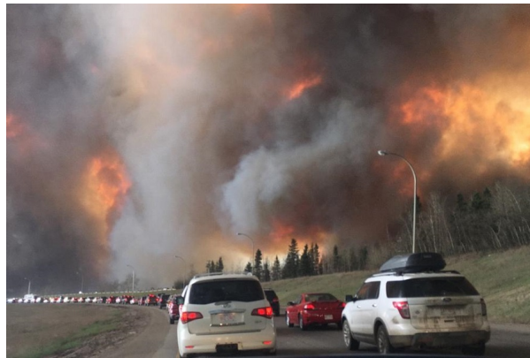
Figure 3. Evacuation of Fort McMurray (a city of 80,000 people in the state of Alberta, Canada) in May 2016.

particularly in the treatment of roofs and openings.