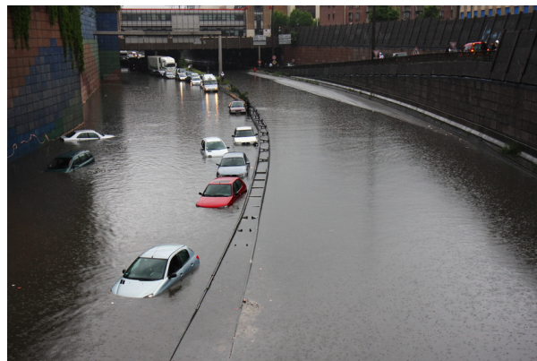
Figure 3. The danger of flooding on the road

But reducing vulnerability requires an understanding of its mechanisms . Yet "disasters are real indicators of human and territorial vulnerabilities within affected communities and societies" [9]. It is therefore from natural disasters themselves that researchers are trying to better understand what vulnerability is, how it is expressed, in an attempt to reduce it. The work in this field has thus made it possible to identify certain specific factors . Poverty is a major factor in addressing global vulnerability: the poorest populations are also the ones most affected by natural phenomena . But recent events, such as Hurricane Katrina in the United States in 2005 or the Fukushima earthquake in Japan in 2011, highlight that poverty is not the only factor at stake. Other causes can increase or reduce the vulnerability of societies and territories . Examples include organizational or political factors: is society prepared for such events, can institutions react in time to limit impacts?