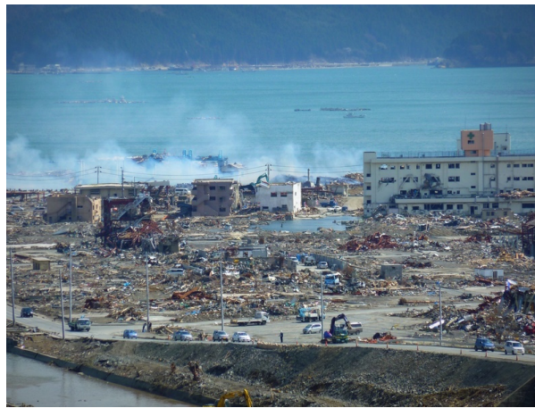
Figure 2. Damage of the 2011 tsumani in Japan

The CRED, Centre de Recherches sur l'Épidémiologie des Désastres , identifies all natural events that occur in the world and studies their evolution [1]. According to 2015 statistics, between 1994 and 2015, more than 8,600 natural disasters killed more than 1.5 million people worldwide, or nearly 76,000 victims per year directly related to natural phenomena. Figure 1, opposite, shows the evolution of the number of natural disasters and casualties over the past 20 years.