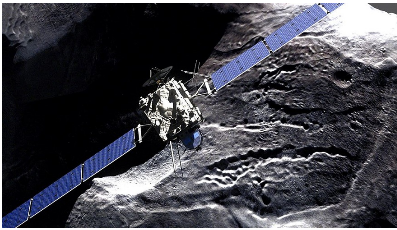
Figure 1. The Rosetta probe flying over comet 67P/Churyumov-Gerasimenko, commonly known as "Choury". Image from the film "Chasing A Comet - The Rosetta Mission".

The planet Earth was, at the time of its formation, initially anhydrous or low in water, which had accumulated in the Jovian planets further from the sun, and in the comet belts (Oort cloud and Kuiper belt); the Earth received most of its water during the first hundreds of millions of years of its existence, and is proportionally the richest in water of the telluric planets (Mercury, Venus, Earth and Mars). A cometary origin of this water , initially favoured, is now seriously questioned, particularly since the European Space Agency's Rosetta mission, which sent the Philae probe on November 12, 2014 (see Figure 1) to land on the comet 67P/Churyumov-Gerasimenko and measure in particular the content of Deuterium in its ice: twice as rich in this isotope of hydrogen as water from the Earth; this type of comets (at least) cannot therefore be at the origin of terrestrial water, instead, the eyes turn to a bombardment by rocky or ferrous asteroids also containing a little water.