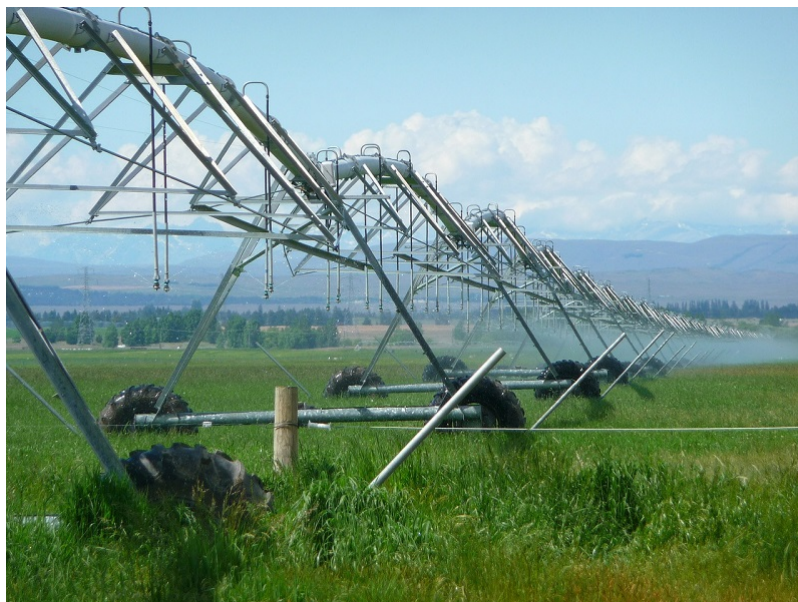
Figure 3. Example of a large-scale irrigation system on maize plots, which consume a large amount of water.

For industrial water , we each use about 1,300 m 3 /year. But this water is only 10% consumed; 90% of it is discharged into the environment, sometimes heated (cooling water) or polluted, if it is not treated.