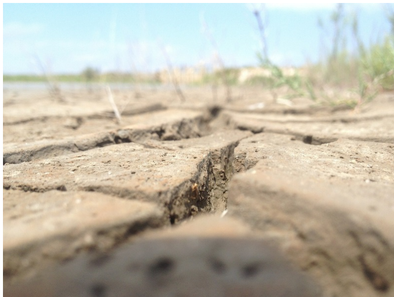
Figure 5. formation of arid lands, even desert and rarefaction of vegetation cover.

Unfortunately, it seems that we can once again get to know worldwide-families . In 1998, a severe drought in Southeast Asia (China and Indonesia) led to massive purchases of cereals on world markets, with a sharp reduction in stocks, which would have been insufficient if the drought had continued (Rojas et al. 2014; Lizumi et al. 2014). However, stocks have gone from 10 months of global consumption 20 years ago to 2 months today... These years of severe drought in monsoon areas are linked to very intense El Niño events , which occur on average twice a century, according to statistics compiled from parish registers in South America (Orltieb, 2000), and were observed for example in 1876-1878 and 1896-1900 at 19th century, each time causing about 30 million deaths (Sen and Drèze, 1999); in the 20th century, they occurred in 1940 and 1998. The effect of climate change on the frequency and intensity of El Niño events is currently under discussion.