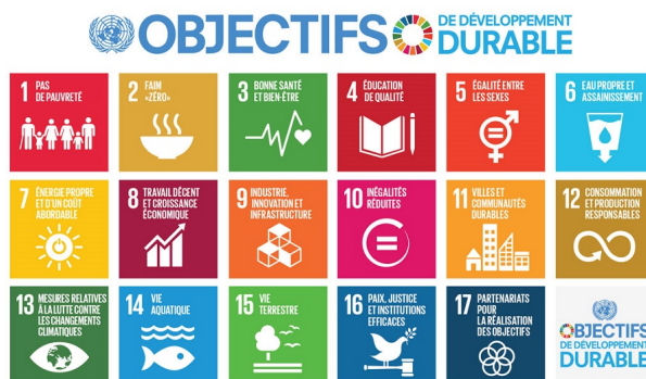
Figure 2. The 17 Sustainable Development Goals (SDOs) of the UN Sustainable Development Programme by 2030.

Sustainable development is a field of questions and problems where many academic works are positioned [8]. However, in recent years, there has been a certain loss of influence of this concept at the national and local levels as well as in the militant demands that had been raised during the 1990s and 2000s. At the UN level, however, the reference remains preminent since it was reaffirmed in 2015 in the context of the "Sustainable Development Goals" (2015-2030) that succeeded the "Millennium Development Goals" (2000-2015), which were crucial development objectives in a North-South context. Under discussion, the "Sustainable Development Goals", which are now valid for all countries, do not have a particular focus on the environment, reflecting the shift over the years towards a broader approach to development.