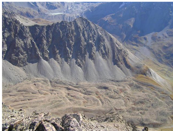
Figure 4. The "fossil" rock glacier (= without any global movement currently detectable) of the Vallon de la Route, in the Combeynot massif (Hautes Alpes)

The diversity of situations observed shows that most of the rock glaciers have a periglacial origin (i.e., the ice comes from burying snow under debris and freezing deep water), which does not exclude the presence of glacial ice (formed initially at the surface by the compaction of a neve). Finally, it should be noted that, regardless of the origin of the ice, only permafrost thermal conditions will allow the development and maintenance of a rocky glacier.