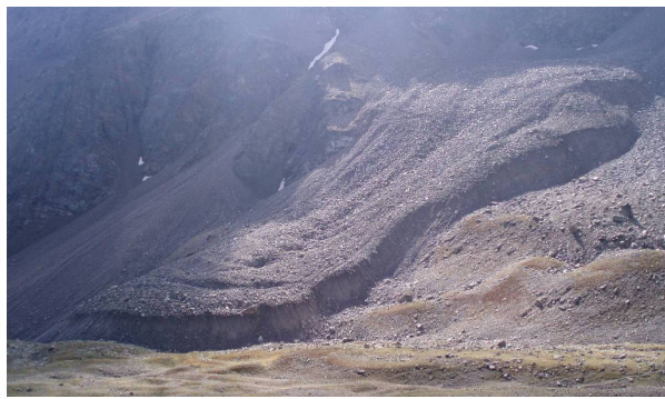
Figure 3. The rocky glacier of Laurichard (Hautes Alpes). The steep edges are well marked (shadows), as well as the shapes related to the flow of the rocky glacier (grooves and bulges).

Rock glaciers are among the most relevant indicators of permafrost, as they are clearly visible in the mountain landscape, and are remarkable both for their extent and their variable response to climate fluctuations. They occur particularly in relatively dry areas where glaciers cannot fully develop. Rock glaciers acquire their very particular morphology (Figure 3), made up of nested bulges and a steep front, by creeping the mixture of rock debris and ice on a sloping substrate.