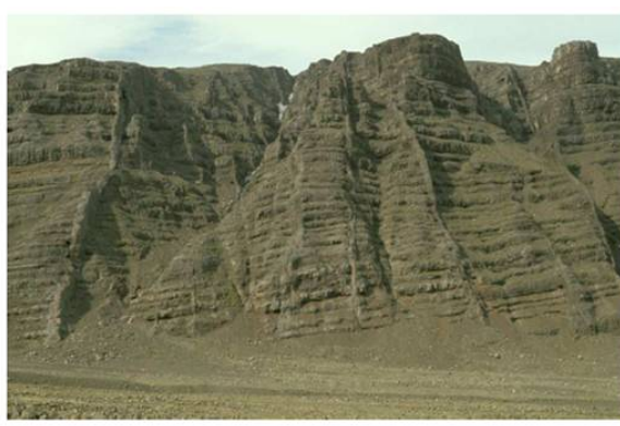
Figure 2. Dykes in Iceland: Once the magma has cooled, volcanic dykes correspond to large flat structures whose geometry reflects the orientation of the principal local directions of stress during the placement of the magma.

Because a hydraulic fracture propagates perpendicular to the minimum principal stress in the massif, its large-scale geometry is controlled by that of variations in minimum principal stress in the massif. For example, Figure 2 shows that volcanic dykes, once the magma has cooled, correspond to large flat structures that provide information on the state of local stress.